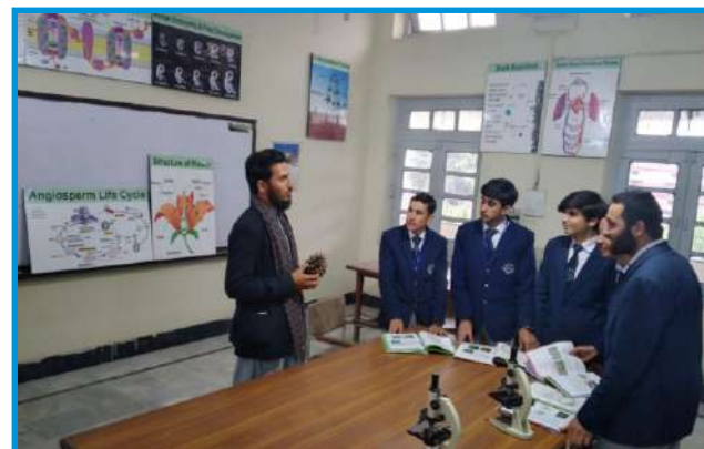
Biology Practical Class