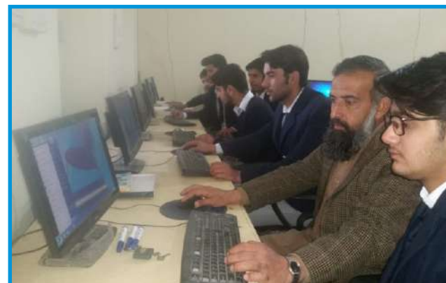
Computer Science Practical Class

The college library is fully automated and contains a good collection of reference books which can significantly build-up the students' knowledge in addition to their textbooks.