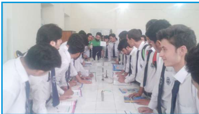
Chemistry Practical Class