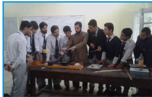
Physics Practical Class